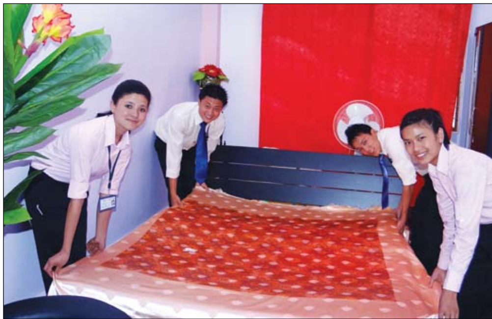
Doing to Learn: Trainees during practicals

W e got this mail from Kalimpong. It speaks of the results of the support BoscoNet gave them. Let every donor, including the school children who contributed or collected even Rs 10.00 for BoscoNet, be blessed by God for the GREAT service they have rendered.)