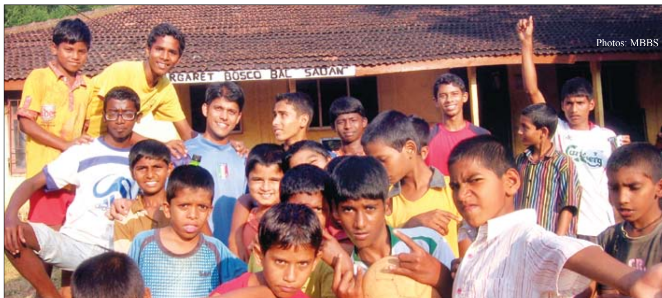
A rich experience: Growing up with boys from different backgrounds

Margaret Bosco provides the needy young a blend of 'what is' and 'what could be' – a chance, ek mauka, an opportunity to shape their lives. The progress each boy makes is a miracle in itself – a miracle of Don Bosco, a miracle of his sons, and a miracle of the generous donors that help us keep the work going.