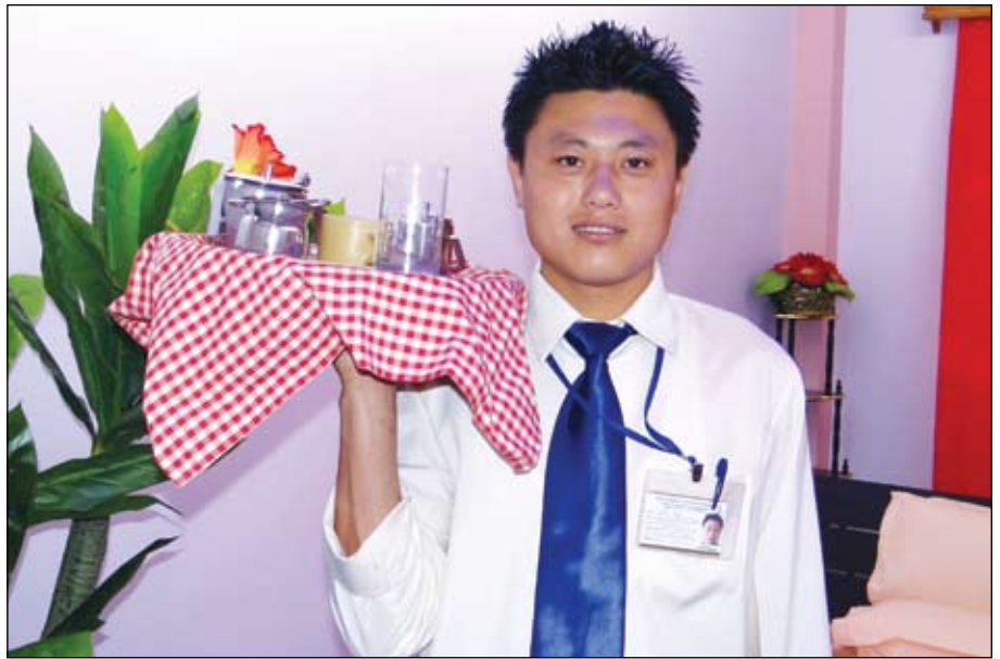
Meticulous efforts are made to train the dropouts

The average income of the Kalimpong trainees is Rs. 4971. It includes even the Rs.10 of the lowest contribution of an individual. My Rs.10 can become Rs. 4971 and make some lone bread winners of a family, and take them out of the danger of turning into anti socials. Your contribution is no more small; it now counts in lakhs.