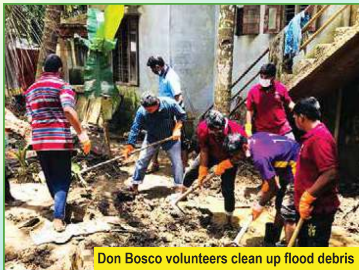
Don Bosco volunteers clean up flood debris

Don Bosco College, along with the students visited the affected families, provided counselling services for those affected by depression, and coordinated relief work in various camps. They have also begun clean-up activities in houses and public places most affected by flood debris.