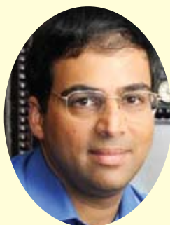
Vishwanath Anand World Chess Champion

"I am grateful to Don Bosco for the education I received. I appreciate their efforts to educate the children of the poor in our country."